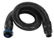
Sound-Dampening Breathing Tube SG-50W