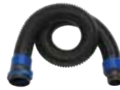
Self-Adjusting Breathing Tube SG-30W

All Speedglas™ Breathing Tubes feature the innovative 3M™ Quick Release Swivel (QRS) Connection, to allow for a quick connection and minimize loops and kinks.