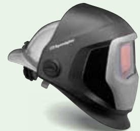
Available with Hard Hat