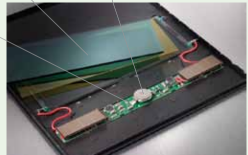
Other U.S. Brand Circuit Board