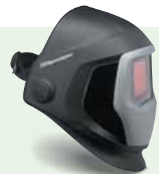
Available with Side Windows