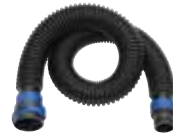
Heavy-Duty Breathing Tube SG-40W